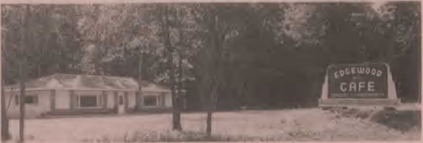
The original Edgewood, opened in 1952.